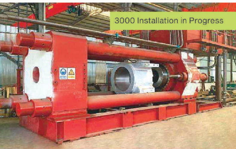
3000 Installation in Progress

Aluminum Profile Extruder delivers high-tonnage precision and structural durability. Designed for complex industrial ecosystems, it integrates advanced mechanical synchronization and intuitive controls for maximum efficiency.