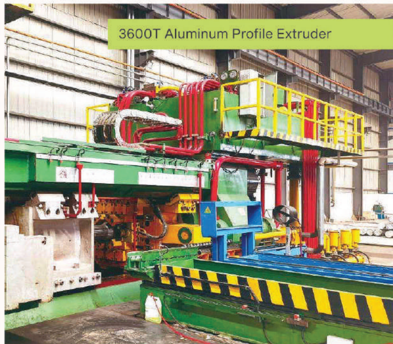
3600T Aluminum Profile Extruder