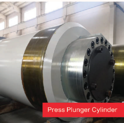
Press Plunger Cylinder