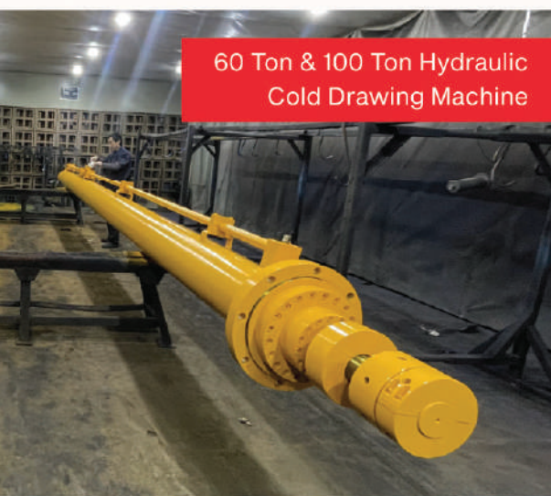
60 Ton & 100 Ton Hydraulic Cold Drawing Machine