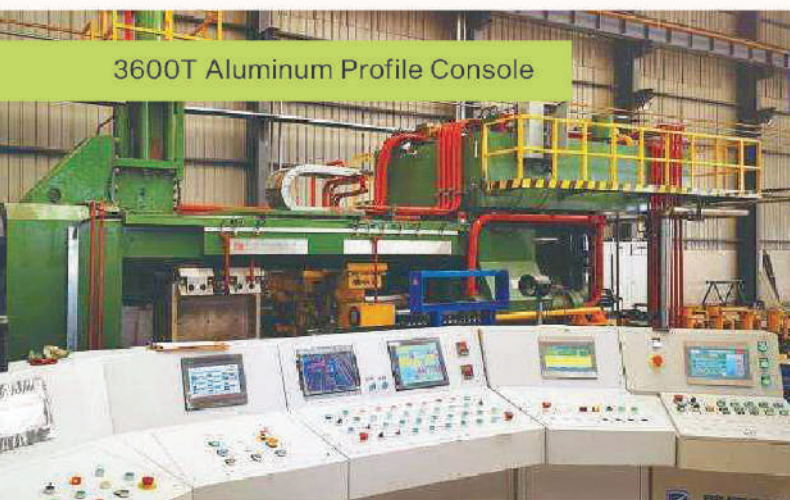
3600T Aluminum Profile Console