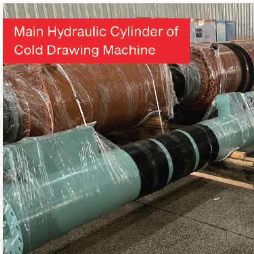
Main Hydraulic Cylinder of Cold Drawing Machine