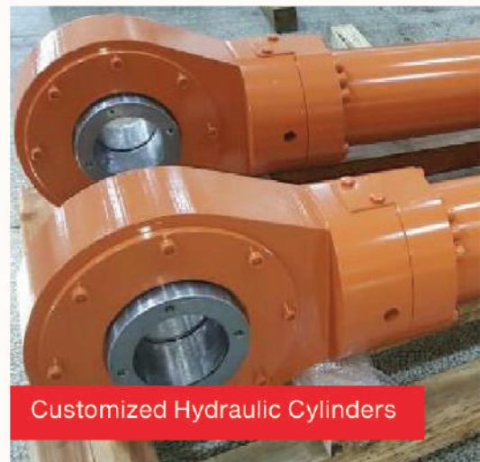
Customized Hydraulic Cylinders